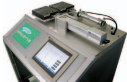
IAI devised a precision power consumption test procedure to measure energy efficiency. Both the air cylinder and ROBO Cylinder were tested with identical variables. Variables included dwell time, cost of electricity, cost of compressed air, speed, payload, stroke, ambient temp and operating time.